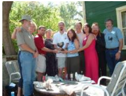
LS Staff and Conveners 2004